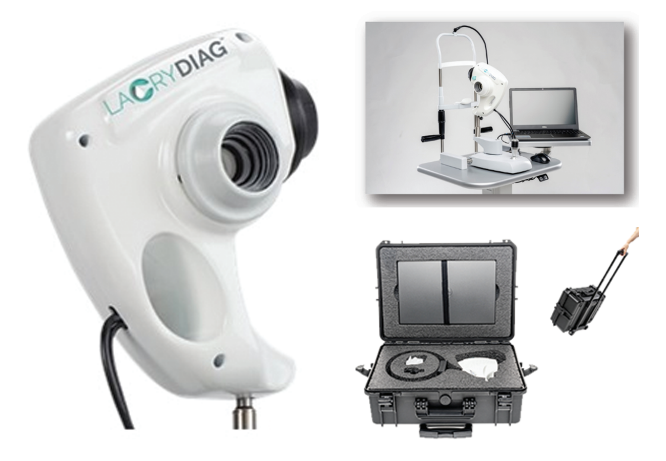
J Dry Eye Dis 3(SP1):e21–e25; April 16, 2020 This article is distributed under the terms of the Creative Commons AttributionNon Commercial 4.0 International License. ©2020 Robben.

device. The LacryDiag includes four non-contact exams that can be acquired in 4 minutes. Non-invasive Tear Break Up Time, Tear Meniscus Height, Lipid Layer Interferometry and meibography are all included within its one software to provide a report of the patient's results. This device has available configurations to be slit-lamp mounted or one its own frame mount alone. It also has a travel case available to allow for easy and safe transport to multiple locations if desired.