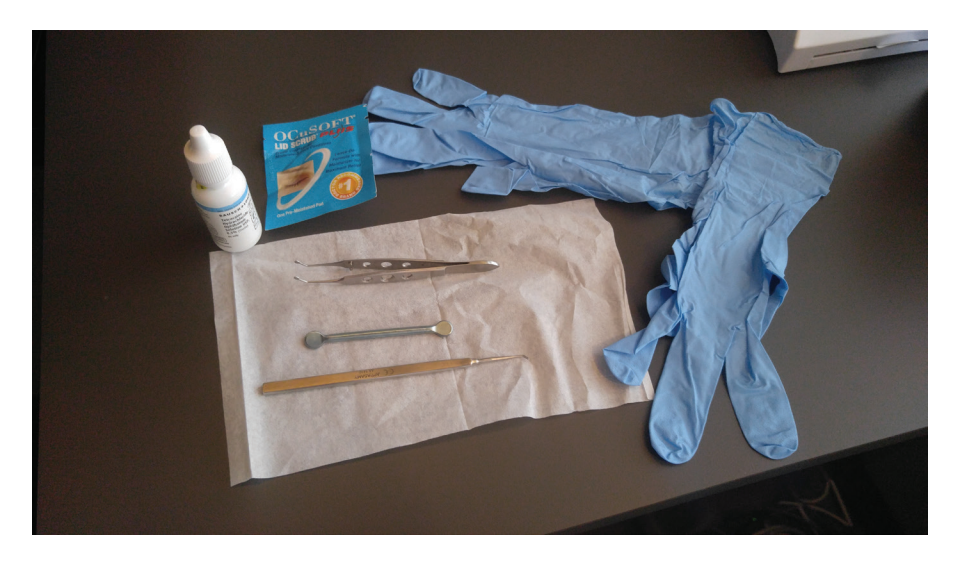
FIG. 5 (A) Equipment for hand meibomian gland expression; (B) Hot compress application prior to meibomian gland expression.