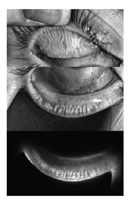
FIG. 2 Meibography imaging showing meibomian gland truncation in lower eyelids.