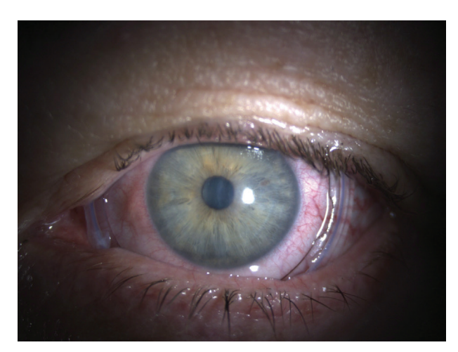
FIG. 3 Example image of Prokera Slim cryopreserved amniotic membrane on ocular surface.

At the 3.5-week mark, visual acuity was measured at 20/25 OD and OS. The patient subjectively reported that the vision in the right eye was clearer than left eye, which had not been the case for five years. She